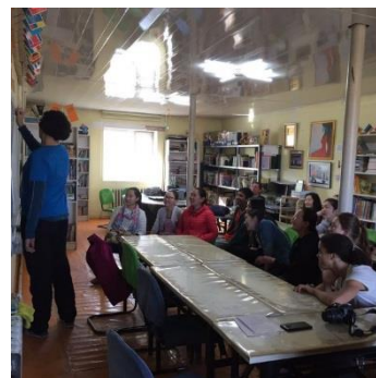
Figure 1 Service Learning through BookBridge in Mongolia

Students reflect on CAS experiences at significant moments throughout CAS and maintain a CAS portfolio . Using evidence from their CAS portfolio, students will demonstrate achievement of the seven CAS learning outcomes.